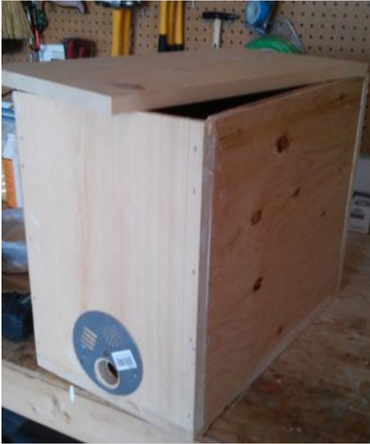
A simple bait box to attempt to catch swarms

15 x 15 inches. Tom Seeley studied what size boxes bees were most interested in when finding a new home and he found that on average bees are looking for a cavity that is about 40 liters in size. Tom Seeley's book "Honey Bee Democracy" is a very good read, taking a simple subject and making it very interesting.