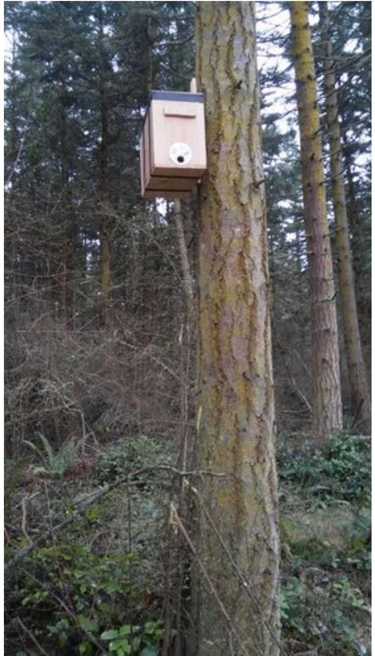
Bait Box about 3 meters up in a tree, facing south

A PDF file on how to make bait boxes and a little more about them can be found online at: https://goo.gl/v0yuFN