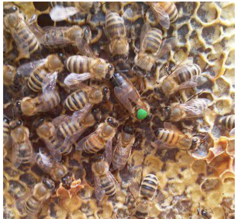
Queen and her attendants on honeycomb

I bring up these articles now because this is the time to ensure you have "Fat Bees", healthy bees to get through the winter and live to see spring.