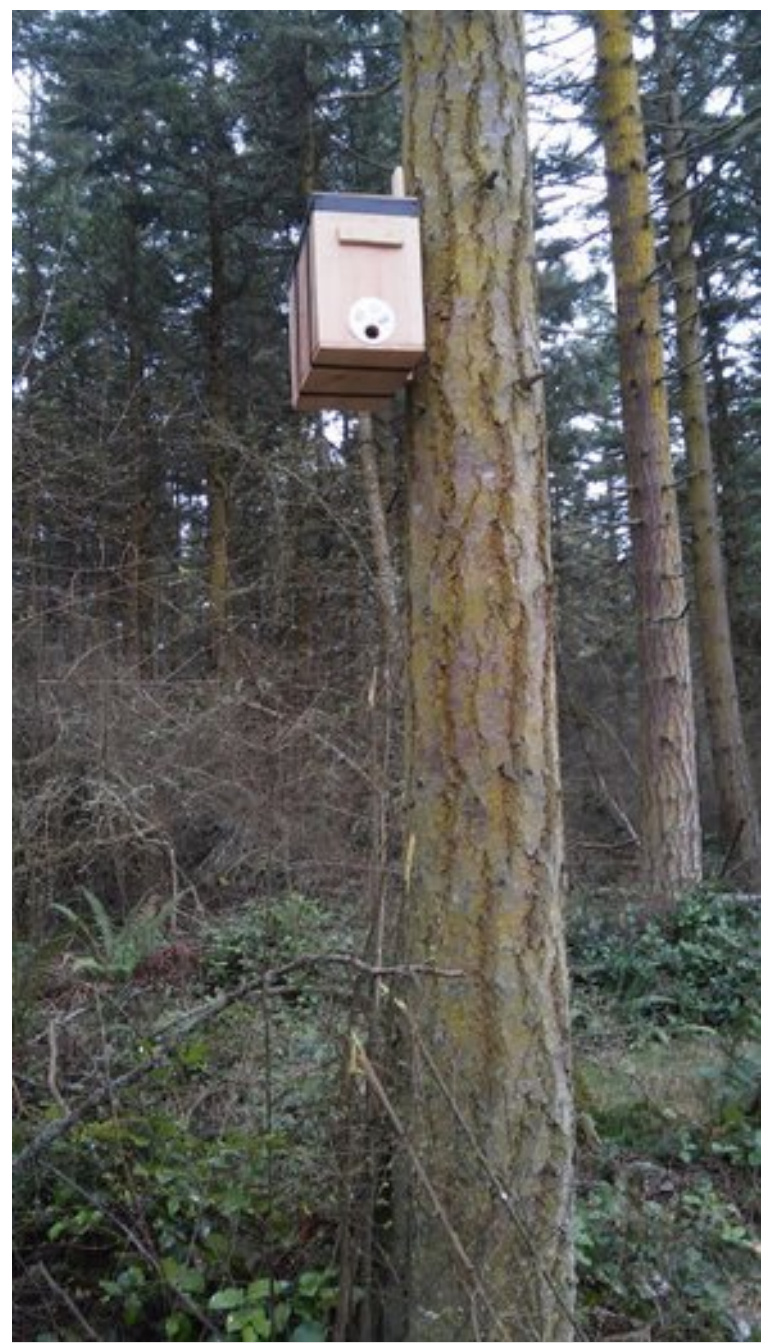
Bait Box about 3 meters up in a tree, facing south

A PDF file on how to make bait boxes and a little more about them can be found online at: <u>https://goo.gl/v0yuFN</u>