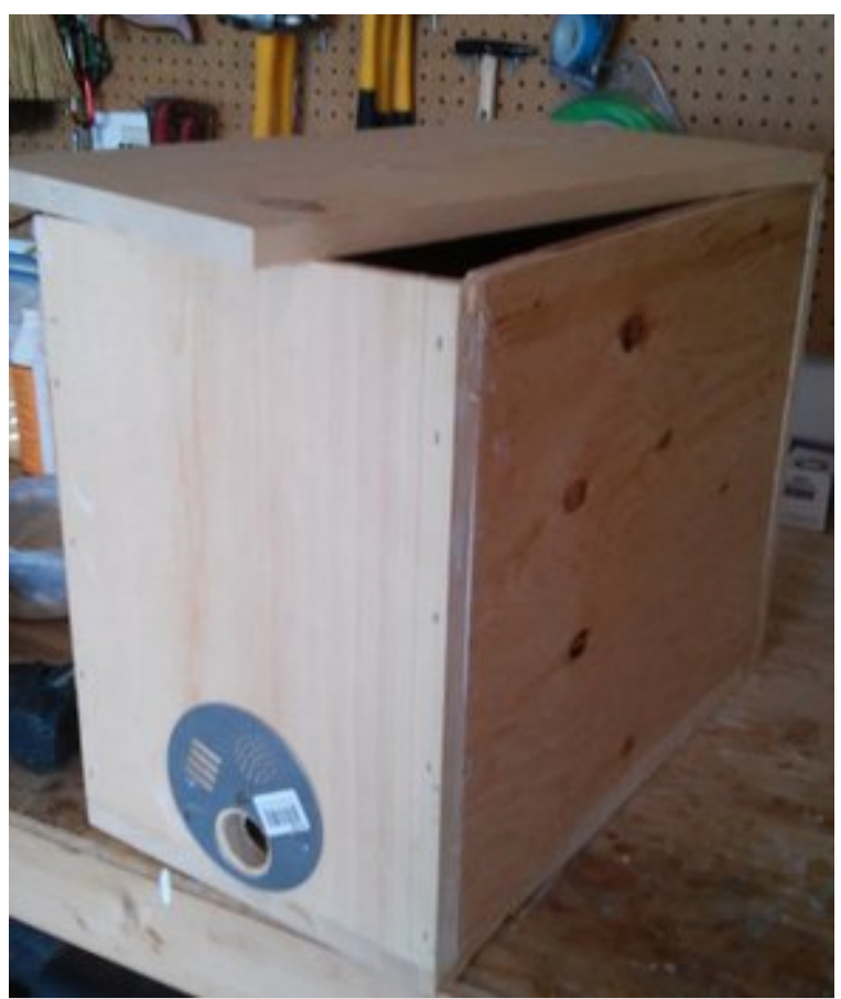
A simple bait box to attempt to catch swarms